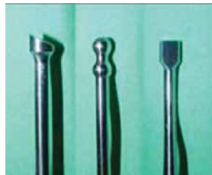
Figure 3. Sonotrope heads – hoof, ball and spatula.

Surgical debridement was the first choice for this patient prior to the use of LFUD due to the complexity of the patient's wound. NPWT had been used on the wound for less than four weeks and discussions were held with the covering general surgical team in regards to goals and outcomes for this patient. A skin integrity clinical nurse consultant (CNC) referral was made four weeks after the laparotomy and revision of stoma (Figure 4). This referral was made to expedite timely debridement for this patient as there were concerns over multiple and subsequent anaesthetics and