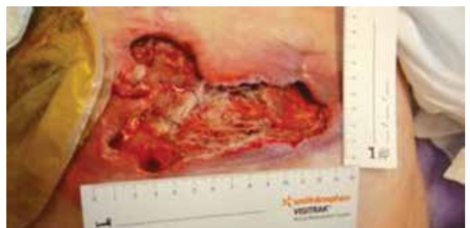
Figure 7. Post third LFUD treatment of 35 minutes' duration. Wound size decreased by over 60%.

The use of LFUD as an adjunct in the healing or improving of chronic wounds was supported by this case study. The outcome for this patient with a parastomal abscess has been positive as complete wound closure was obtained. The LFUD achieved all the expected outcomes for this wound in that the