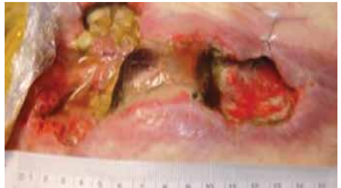
Figure 6. Post second LFUD treatment of 47 minutes' duration.

tissue with maintenance NPWT to have the wound surgically grafted 12 days after the final LFUD treatment. Recovery was uneventful post-skin graft and the patient was discharged home.