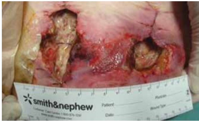
Figure 4. First view of wound post-laparotomy and revision of stoma.

The third treatment of LFUD was of 35 minutes' duration. The right proximal wound depth decreased by 3 cm to measure 5 cm in depth, the right side of wound of 2.5 cm depth was resolved (very close to the stoma) and the proximal flap remained 4 cm deep (Figure 7). The hoof sonotrode head was used for the flat surfaces of the wound and the double ball sonotrode head was used for the undermining cavity and sinus areas. Amplitude was adjusted to 100% with flow adjusted to 40% according to the patient's tolerance and suction was simultaneously applied. The double ball revealed a 4 cm left distal tunnel. This section of wound treatment was limited due to the patient's severe pain.