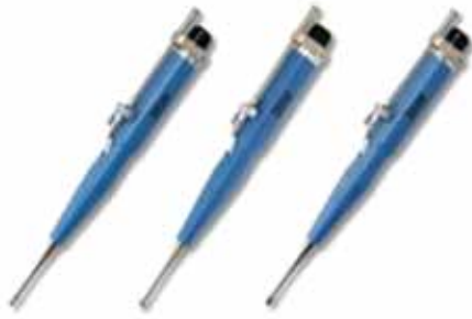
Figure 2. Sonotrobes.

debriding and healing at the same time 13,18 . Amplitude or speed of the ultrasound waves can be adjusted on the generator according to the patient's tolerance, debridement and/or antibacterial needs 13,17 .