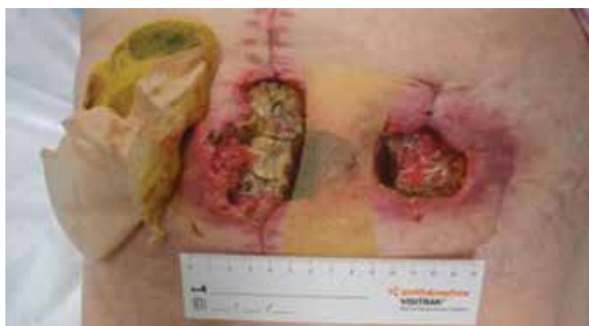
Figure 5. Post first LFUD treatment of 48 minutes' duration.

The patient's length of stay was 66 days with the four LFUD treatments occurring over a 10-day period. NPWT was continued for just under nine weeks. There was successful wound healing of over 60% within five days of commencing LFUD. Within another three days the wound size had decreased by almost another 50%. The patient returned to rehabilitation care and gained sufficient wound granulation