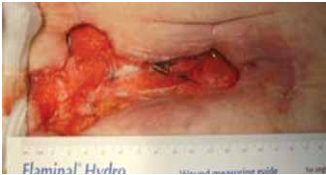
Figure 8. Post fourth LFUD treatment of 25 minutes' duration. Wound size decreased by almost another 50%.

wound bed preparation was acceptable for skin grafting by removing unhealthy tissue and bioburden, while controlling the patient's level of discomfort and pain. The patient required minimal medication including anaesthetic agents and analgesics, and no intra-hospital transfer was required with cost benefits for the treating hospital. In addition, treatment time leading to health benefits for the patient was reduced. Given the wound care for this patient was led by the skin integrity CNC and the ability to utilise the LFUD in the clinical setting, there was the capacity to maintain a degree of flexibility with treatment times, thus allowing for other patient care needs.