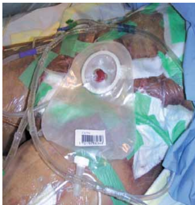
Figure 2. Use of foam cavity filler at base of wound cavity and gauze at surface as interface for negative pressure suction.

On the 26th postoperative day (Figure 1), the patient underwent her fourth surgical intervention in January 2009, as the distal two-thirds of the left dorsi flap and distal 6 cm of rectus abdominis flap were deemed significantly compromised. The compromised portions of the flap were resected and a cutaneous flap was rotated from her right abdominal and thoracic wall to cover the abdominal defect. The patient was again brought to the operating theatre for the fifth time 15 days later for debridement of left lateral dorsi donor site wound and abdominal wound. A mucous fistula was also identified at the seven o'clock position of the margin of the enterostoma (Figure 1). Large amounts of urine, bile and haemoserous exudate continued to drain into the wound bed.