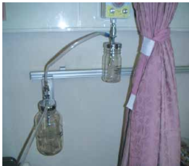
Figure 3. Suction system.

The wound and peri-wound skin were cleansed with warm normal saline 0.9% and excess normal saline was drained from the wound.. Foam cavity filler dressings and four