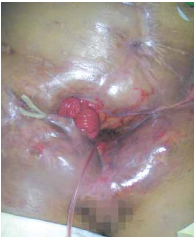
Figures 4 and 5. The wound had contracted and the surrounding skin has made tremendous improvement and the skin was kept intact throughout the healing phase. The leakage from the bladder defect and ileostomy was well contained. The mucous fistulae have closed.