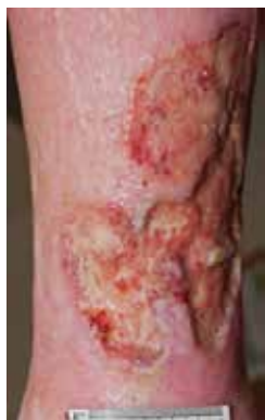
Figure Mrs M #2 28 November 2013