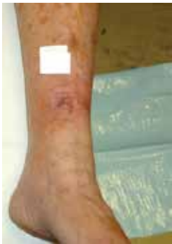
Figure Mrs E #4 23 May 2013

Bodyflow™ treatment was ceased. Education was provided regarding ongoing compression use and pressure-reduction measures. A review by a vascular consultant was obtained and no surgical intervention was recommended.