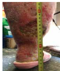
Figure Mrs J #2: right leg 12 April 2013