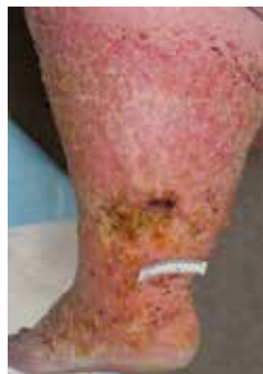
Figure Mrs J #5: left leg 8 August 2013

Throughout the remainder of July and August 2013, Mrs J used the Bodyflow™ Therapy an average of two sessions per week with the duration of the session anywhere between 20 and 60 minutes. Images of Mrs J's next wound clinic visit on 8 August 2013 were available (Figures Mrs J #5 and #6) and wound tracings attended in early September (5 September 2013) suggest the wounds were progressing well towards healing; the ulcers measuring 15 cm 2 and 13 cm 2 for the left and right ulcers respectively.