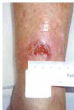
Figure Mrs E #2 4 April 2013

A review of Mrs E wounds was conducted one week after commencing the Bodyflow™ treatment (4 April 2013). Mrs E reported implementing the Bodyflow™ treatment three times daily and using tubular form compression in between Bodyflow™ treatments. The leg appeared less oedematous although baseline measures were not available to quantify the change, and subsequent measures of the calf circumference revealed no further change. The wound size on the left leg was reduced to 1.75 cm 2 , wound margins were progressing and there was evidence of epithelisation (Figure Mrs E #2). There was decreased serous exudate, minimal periwound inflammation, and Mrs E reported decreased pain at the wound site. There was evidence of petechial bleeding bilaterally at the site of the gel patches. Anticoagulant therapy or diagnosis of a bleeding disorder was excluded. Adhesive removal wipes were subsequently used to facilitate the removal of the Bodyflow™ electrodes. Treatment continued with the Bodyflow™ device, the wound was dressed with a viscopaste patch and an absorbent pad in place, and two layers of tubular form compression. The wound on the right ankle had a dry scab approximately 1–2 mm in diameter; there was nil indication of inflammation or report of pain.