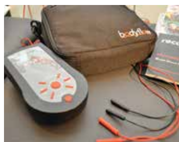
Figure 1: The portable BodyFlow™ electrostimulation device

The Bodyflow™ electrostimulation device is a small, portable device suitable for self-administration in the home setting. Users require brief instruction on the operation of the device. It is recommended that the Bodyflow™ Therapy is used four times daily for 20-minute sessions. Electrodes are attached to the lower limb around the wound and not directly over it. The device is pre-set to a single, non-adjustable, specific low frequency found between one and two Hertz, a current that specifically targets smooth muscle. Use of the device can create a pulsing or tingling sensation. The therapy has approval with the Australian Therapeutic Goods Administration (TGA) as a Class IIa 35046 Stimulator, electrical, soft tissue. Registered applications include circulation increase in venous and blood flow and swelling oedema reduction. The therapy is registered with Medibank Private.