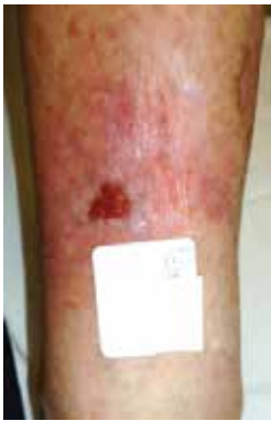
Figure Mrs E #3 2 May 2013