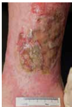
Figure Mrs M #1 20 June 2013

For Mrs M, the characteristic fluctuation in wound size and periods of infection observed over the three–four years she had had her wounds was unchanged, despite consistent but less than recommended routine use of Bodyflow™ Therapy.