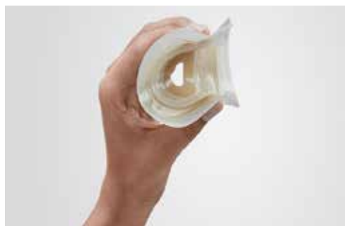
Figure 2. Example of a convex product combining flexible shell design with elastic adhesive (SenSura Mio Convex).

Once the product is in place, the adhesive must work with the elastic convex shell to maintain seal integrity during dynamic movements, such as bending, stretching, sitting and lying down, while offering optimal elasticity (Figure 2). This