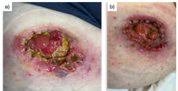
Figure 4. a) Stoma site 48-hours post-surgery, visible mucocutaneous dehiscence and ulceration around the stoma, b) Stoma site at the follow-up visit, cavity had resolved and peristomal skin had improved.

Initial management included insertion of a gelling fibre wick (Aquacel, ConvaTec) to soak slough and wound exudate