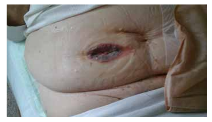
Figure 3. Example of a person with a permanent left colostomy and a trans-ileal cutaneous ureterostomy (Bricker's intervention) with purple urine bag syndrome<sup>47</sup>.

Lastly, the ostomy patient will occasionally find themselves with more than one stoma, all of which may be permanent (Figures 3 and 4). From our experience, these complex situations are more frequent than they were previously and are often related to malignant pathology.