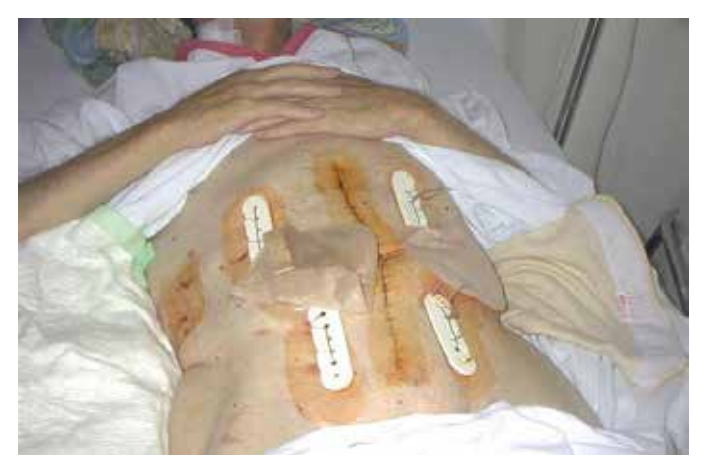
Figure 4. Example of a postoperative patient several days later with a temporary colostomy and a protective ileostomy. Digestive continuity would be restored in 9 months over two interventions, commencing with the downstream ostomy before the upstream ostomy, over an interval of a few weeks.

Contrary to some preconceptions, stomal therapy is not solely concerned with the care of ostomy patients, even though the usage of the original term enterostomal therapist (ET)<sup>48</sup> may