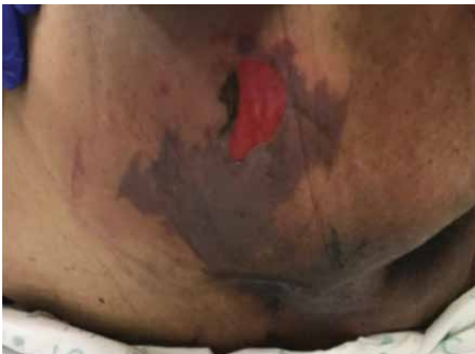
Figure 1 right buttock, sacrum and coccyx on day 3.

time. Two patients progressed to overt disseminated intravascular coagulation (DIC). DIC has been described before; Tang et al. 9 reported that 71.4% of non-survivors and 0.6% of survivors of COVID-19 showed evidence of overt DIC.