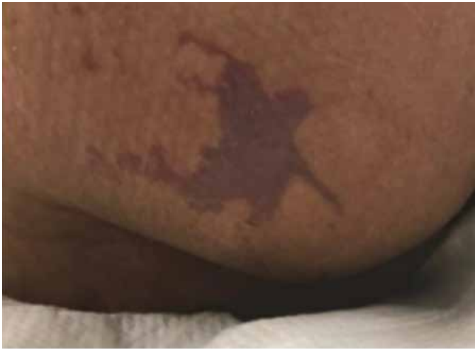
Figure 1 right buttock on day 1