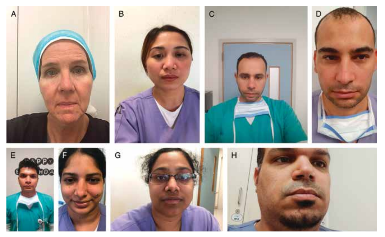
Figure 4. All faces after 1 hour of mask wear with facial protection

consistent up to six sprays. Therefore, 95% blockage was achieved with this mask configuration. This outcome was certified by infection control as conforming to international standards—that is, all eight participants passed the fit test while using the atraumatic dressing.