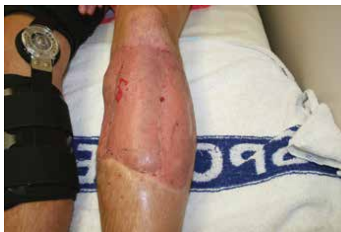
Healing phase of a free flap

Interestingly, research questionnaires and research tools aimed at assessing the functional outcomes of patients following open lower limb fractures do not classify lymphoedema as a parameter of interest 18,38 . This is a concerning oversight that fails to acknowledge the role of a healthy lymphatic system in normal wound healing and the adverse outcomes associated with a failing lymphatic system. Lymphoedema impacts considerably on a patient's quality of life, mobility and emotional wellbeing, and leaves the injured limb with an increased risk of recurrent infection and delayed healing 42 . However, it is recognised that patients complain about oedema and diminished sensibility in the leg or foot, but a treatment or procedure protocol remains absent 39,43 . Studies of short and long-term outcomes of lower limb trauma patients show poor functional outcomes and this is of significant concern 44 . Correlation of poorer outcomes with lymphatic dysfunction may help to identify patients that are at risk of wound healing complications so that appropriate management can be implemented.