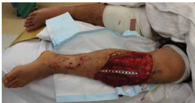
Severe lower leg trauma with extensive soft tissue loss

soft tissue loss. The extent of the injury results in an open fracture. An open fracture is to be handled with extreme care and is a surgical emergency due to damage of not only the bone but also soft tissue, blood and lymphatic vessels at the micro and macro levels 19 . Open fractures are likely to be sites of mal-union and superficial infection as well as infection of the deeper (sub-fascial) and bone areas 20 . Fractures are the most common type of hospitalised injury and treatment requires immediate irrigation and debridement 21 .