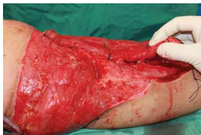
Free flap reconstruction (latissimus dorsi flap)

The treatment of compound fractures with extensive soft tissue loss depends on the overall presentation of the extent of bone, soft tissue and vascular injury and requires a multidisciplinary approach 24 . Therefore, there is no standard practice that can be applied to all patients. However, treatment such as immediate debridement of contaminated and devitalised tissue followed by reconstruction with either skin grafting in minor wounds or more complex muscle flaps