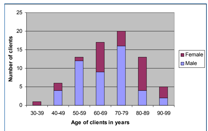
Figure 1. Age and gender of clients who attended the CWS.

A total of 45 males and 29 females (n=74; Figure 1) attended the CHS CWS during the audit period. The mean age for males was 65 years (range 42–90) and for females 71 years (range 37–90).