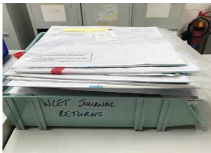
Figure 1. Returns of the WCET® Journal

(67.57%) and the website (63.95%) as the top four most valued WCET® assets. This year for the first time ETNEP/REP was ranked first over the WCET® Journal for the response as to what is most important to members.