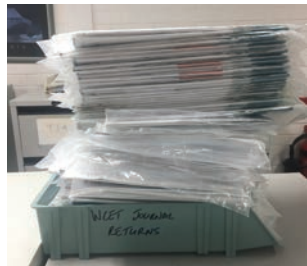
Figure 2. Number of journal returns during the COVID-19 pandemic.

Please look for an email in the next few months calling for nominations for the 2022–2026 President Elect position.