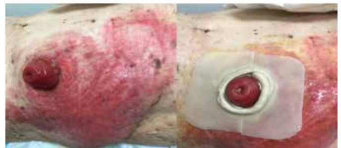
Figure 7. Case study 3: Day 1, 10 February 2019

On assessment at the outpatient clinic, gross erythema over the left abdomen was noted; the skin was also weepy and denuded, the ostomy appliance was reinforced with Tegaderm™, and the patient was also using nappies. The skin looked like a mixture of contact dermatitis and fungal infection (Figure 7).