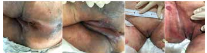
Figure 6. Case study 2: Day 6, 30 September 2019