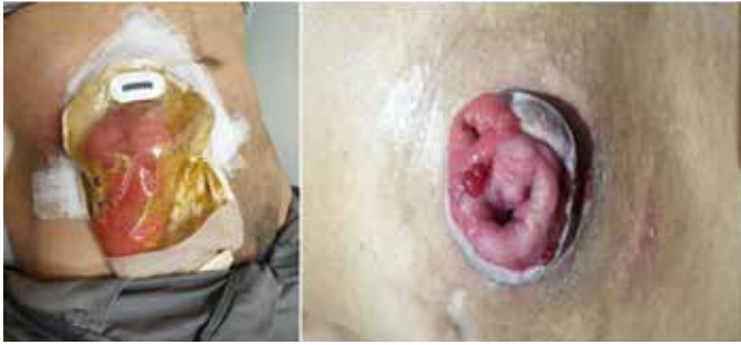
Figure 3. Case study 1: Day 8, 8 October 2019