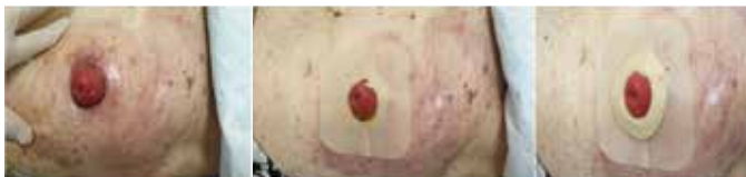
Figure 9. Case study 3: Day 12, 22 February 2019