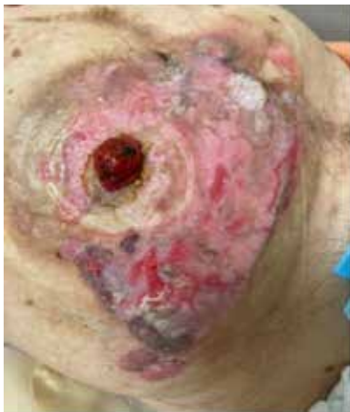
Figure 8. Case study 3: Day 5, 15 February 2019

On 15 February 2019 (Day 5) the patient returned to the outpatient clinic for review; the skin was observed to have dried up with scabs, was cool to touch, and was not weeping. A protective hydrocolloid sheet was reapplied after the skin care regimen described above (Figure 8). On 22 February 2019 (Day 12), the patient's skin had healed significantly with only light erythema present with no signs of previous scars within the healed tissue (Figure 9). During the remainder of her admission the protective hydrocolloid sheet was to protect the peristomal skin. The patient was discharged on 24 February 2019 and a protective sheet was still used to protect the skin until her elective admission.