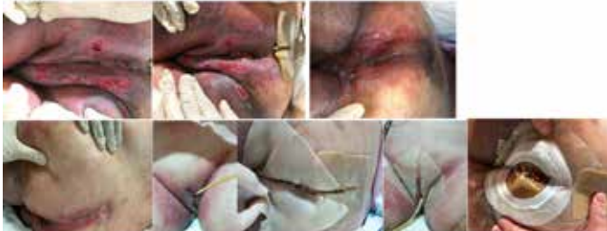
Figure 4. Case study 2: Day 1, 24 September 2019

The patient was referred on 24 September 2019 (Day 1). On assessment it was noted there were healed scars from previous episodes of impaired skin integrity. At that time, the tissue was erythematous and weeping and her skin temperature was warm to touch (Figure 4). The patient was observed to be teary and agitated.