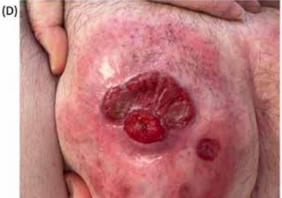
Figure 1. Types of PG A=ulcerative (classic) PG on the lower leg B=bullous PG on the dorsal hand, rapidly progressing to an undermined violaceous-bordered painful ulcer C=painful PG lesions on the buttock of an individual with hidradenitis suppurativa and IBD, and a verrucous plaque of vegetative PG on the lateral ankle D=peristomal PG in the setting of Crohn's disease