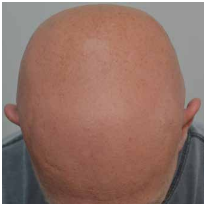
Figure 4. Example of AT

Nail disease occurs in 10–15% of cases of AA and may precede, succeed or coincide with active hair loss. Nail involvement may include pitting, onychorrhexis, trachyonychia, punctuate leukonychia, onycholysis, onychomadesis and red spots on the lunulae 19 . Due to the association with AU and AT, nail involvement may be considered a poor prognostic factor 3,7 .