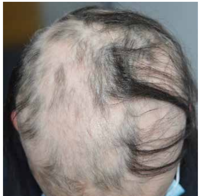
Figure 3. Example of patchy AA with mixed areas of regrowth and coalescing patches

with chronic AA, where patches persist beyond 1 year, have a 30% risk of progressing to total loss of scalp hair (AT) and a 15% risk of losing all hair on the body (AU) (Figure 4) 6 . Hair loss in AA may also occur in an ophiasis distribution, characterised by band-like hair loss extending across the occipital scalp (Figure 5). An inverse ophiasis pattern called sisaipho has also been described; this pattern of AA resembles male androgenetic alopecia and involves loss of hair in the frontal, temporal and parietal scalp with sparing of the scalp periphery. Occasionally patients may present with diffuse AA, often referred to as AA incognita, without any discrete patches (Figure 6) 1,3,15 .