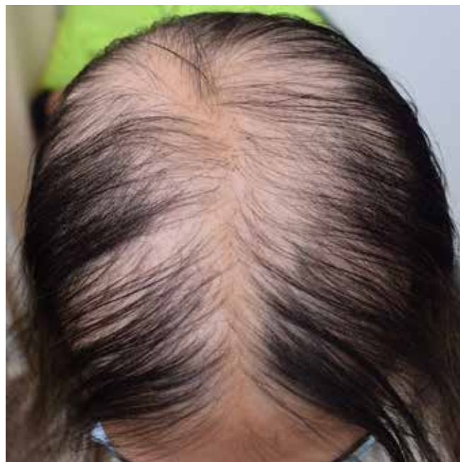
Figure 6. Example of acute diffuse AA