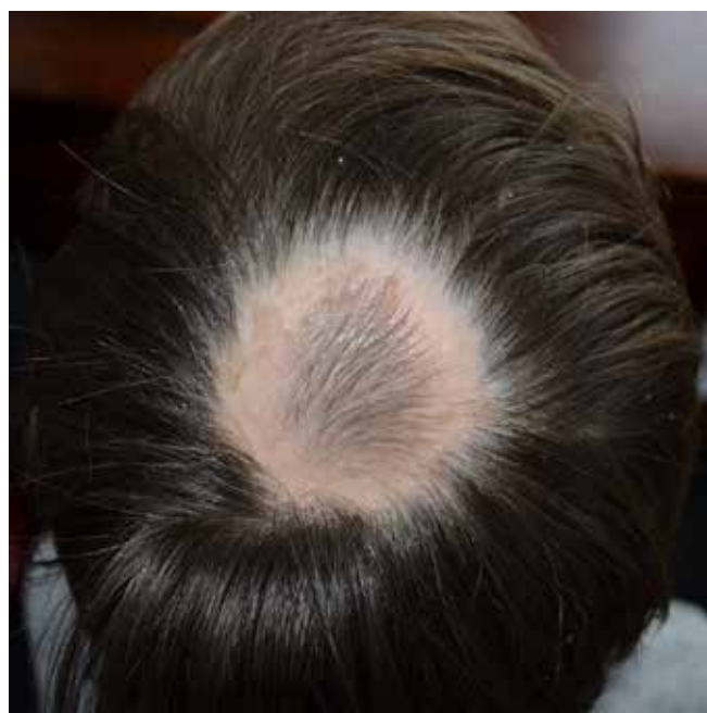
Figure 7. Example of regrowth of hair within an AA patch