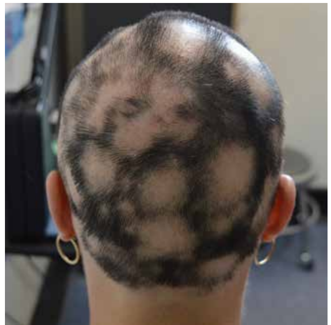
Figure 2. Example of patchy AA