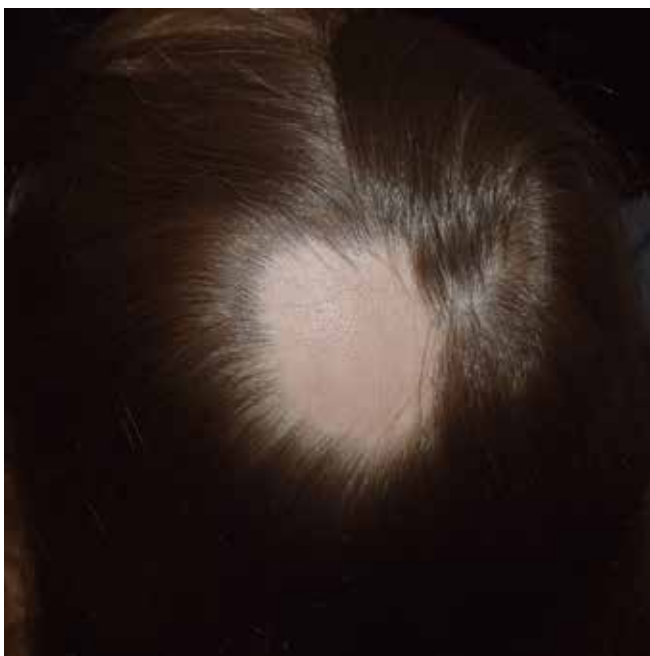
Figure 1. Example of acute patch of AA affecting the occiput

Approximately 40% of patients with AA will only ever develop a solitary patch which, if left untreated, spontaneously regrows within 6 months. An additional 27% of patients will develop further patches (Figures 2 & 3) yet still achieve complete remission at 1 year. However, most patients will relapse in the months or years after remission 6,15 . Patients