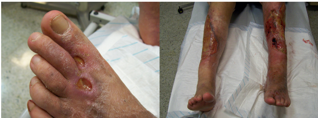
Figure 5: Examples of wounds caused by illicit drug use

Injecting drugs damages the venous and lymphatic system, and adulterants have a sclerosing effect 179 , leading to the sclerosis and thrombosis of superficial veins. 185 The risk of venous insufficiency is increased when PWIDs inject drugs into the groin, as the sclerosing substances are transported immediately into the veins of the lower limb. 179 Phlebitis may be induced by the vasoconstriction of blood vessels