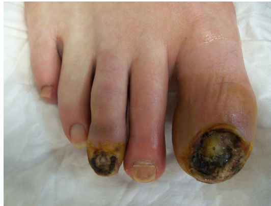
Figure 3: Cannabis arteritis

The pathogenesis of CA remains unclear and debated and causes disagreement as to whether to name the condition CA or cannabis-associated arteritis. 142 It is thought to be a subtype of Buerger's disease because of the comparable clinical and arteriographic findings in both disorders. 137