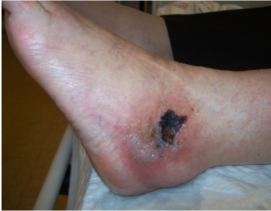
Figure 4: Example of hydroxyurea induced leg ulcer

the malleolar region and often non-responsive to local wound care and systemic therapy. 163-165 To achieve wound healing, cessation of the medicine is needed. 163,164 In some cases, debridement and skin grafting should be considered. 163,164