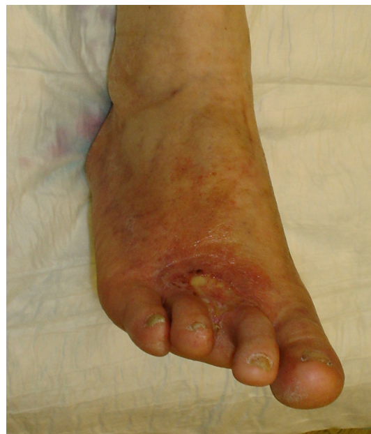
Figure 2: Buerger's disease

Although the aetiology of Buerger's disease (See Figure 2) is unknown, a complex interaction between smoking, genetics, hypercoagulability, endothelial dysfunction, infection and immunologic mechanisms is suspected. Tobacco smoking plays a central role in the initiation and progression of the disease. 131 TAO presents in young male smokers with complaints of claudication, pain at rest, distal ischemic ulcers or gangrene. 132 The diagnosis is made by ruling out other vascular or autoimmune diseases. 133 An abnormal Allen test is highly suggestive of TAO. 132 Total and immediate abstinence of all tobacco-related products results in spectacular improvement and is the cornerstone of treatment and prevention of amputation. 132,133 Revascularisation is mostly not possible, and other treatment options, such as sympathectomy, spinal cord stimulation, growth factors, and prostacyclin, need to be investigated more thoroughly. 133