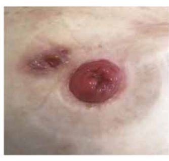
Figure 2. Case study 1 – 19 August