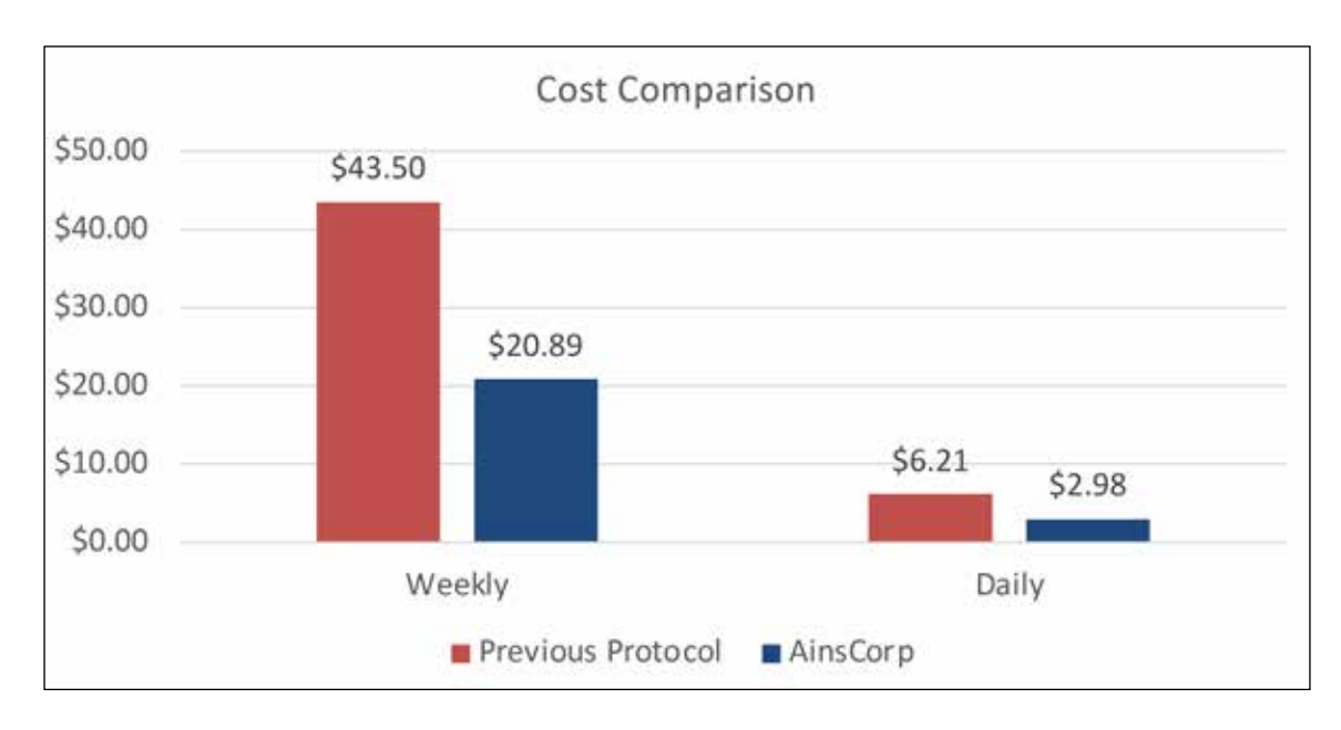
Figure 13. Case 2 - cost comparison of standard treatment vs combination HA+SSD treatment on a weekly and daily basis