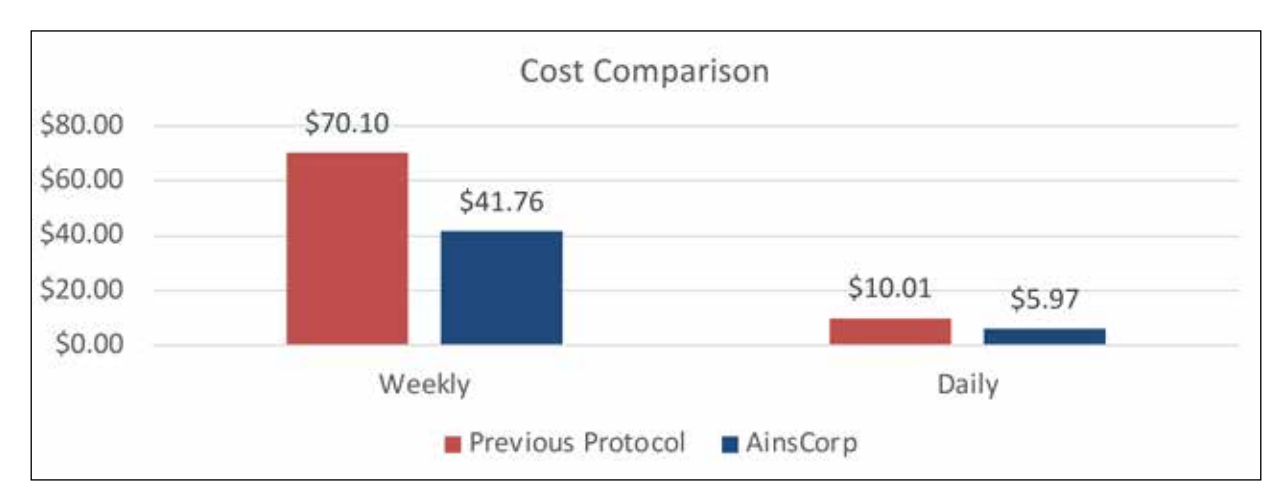
Figure 6. Case 1 – cost comparison of standard treatment vs combination HA+SSD treatment on a weekly and daily basis

Following 6 weeks of treatment (Figure 8), the ulcer was healed and treatment was ceased; however, the new granulation tissue in the 5 o'clock to 7 o'clock section of the ulcer appeared to be very fragile. The patient then re-presented on 8 October with the ulcer having broken down again (Figure 9). The wound measured 10mm x 5mm, with a sloughy pale base, wound edge maceration, low exudate and no pain, no oedema and no