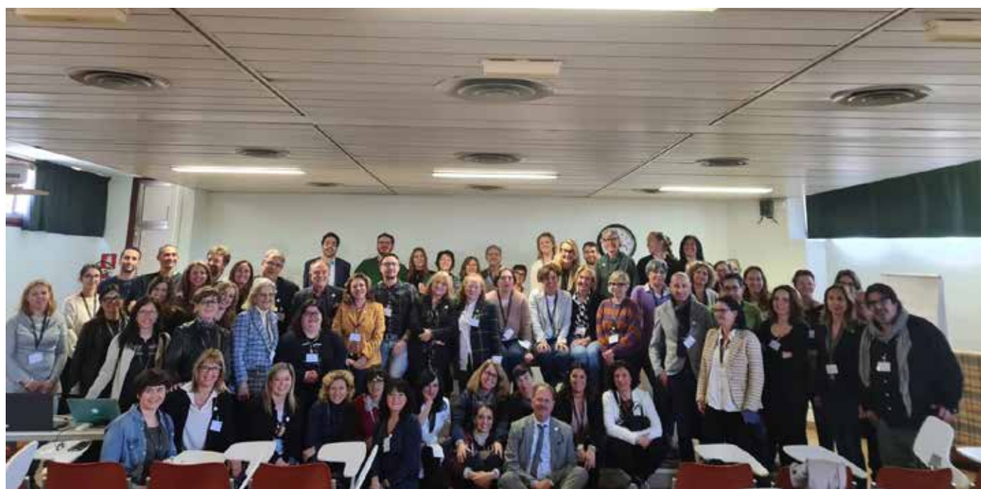
Photo of the participants in the Diabetic Foot Valley project, taken in Florence on 15 April 2023.